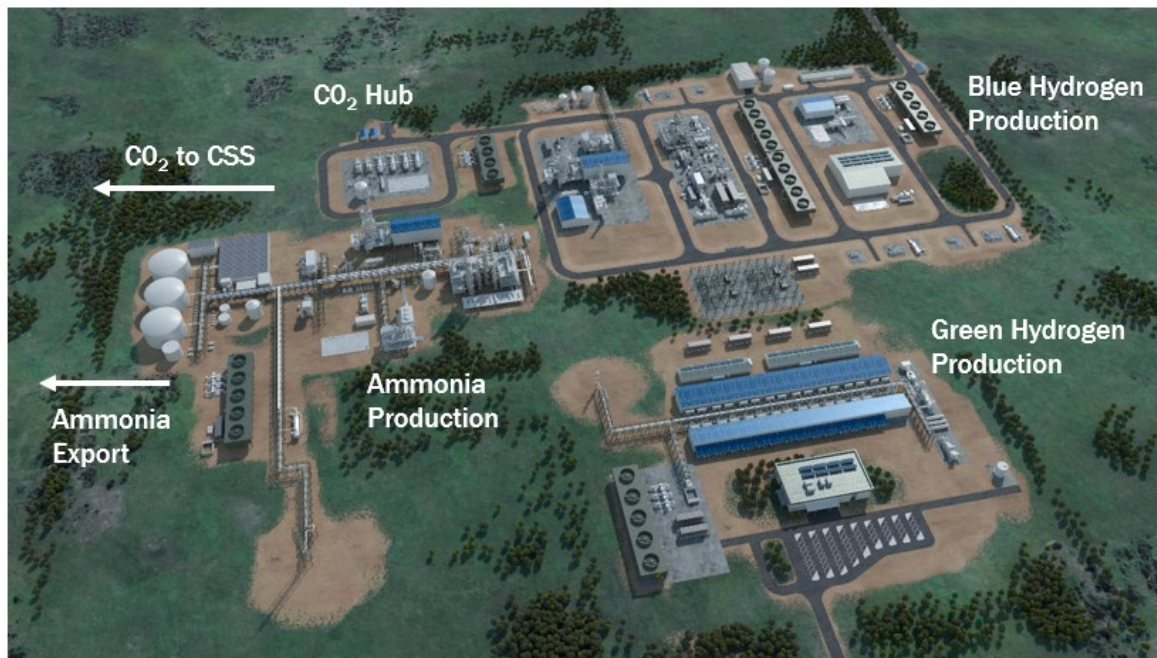
Figure 2. Graphic depiction of the Mid-West Clean Energy Project